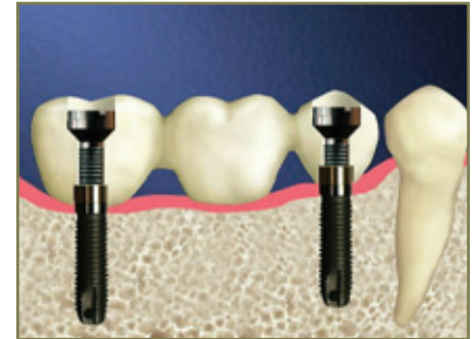
Bridge is placed