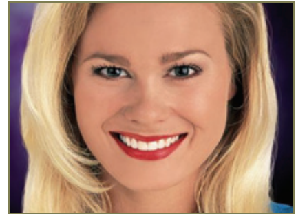
Smile with confidence